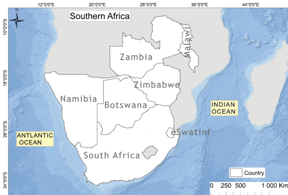
FIGURE 2 Location of study areas in southern Africa